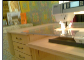
Flush mount to standard acrylic tables

The adjustable machine support, can be flush with the table top or lowered to provide a level surface between an extended acrylic table (not included) and sewing machine deck. This height adjustment alleviates stress on the shoulders and neck.