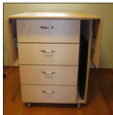
Compact, yet functional when leaves are dropped

The open surface presents a 60" by 37" work area that compacts to 28" by 37" with the leaves down. So even when the unit is folded down it can still hold a large cutting mat.