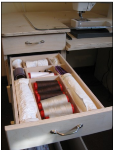
Flexible Drawer System

Good design comes from good research. Partnering quilters' suggestions with direct observations of quilters at work, gave birth to a more ergonomic sewing center.