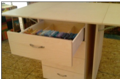
Cutting Center with fat 1/4 filled drawer