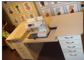
Big work surface with drop leaf extension

The large work surface with 12" drop leaf provides ample work space. The unit is finished with beeswax to give a smooth chemical free finish.